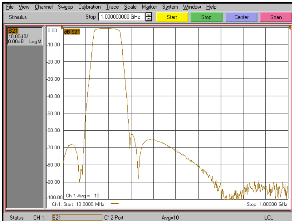
Overall Response (10 dB/div)

KR Electronics, Inc. 91 Avenel Street Avenel, NJ 07001