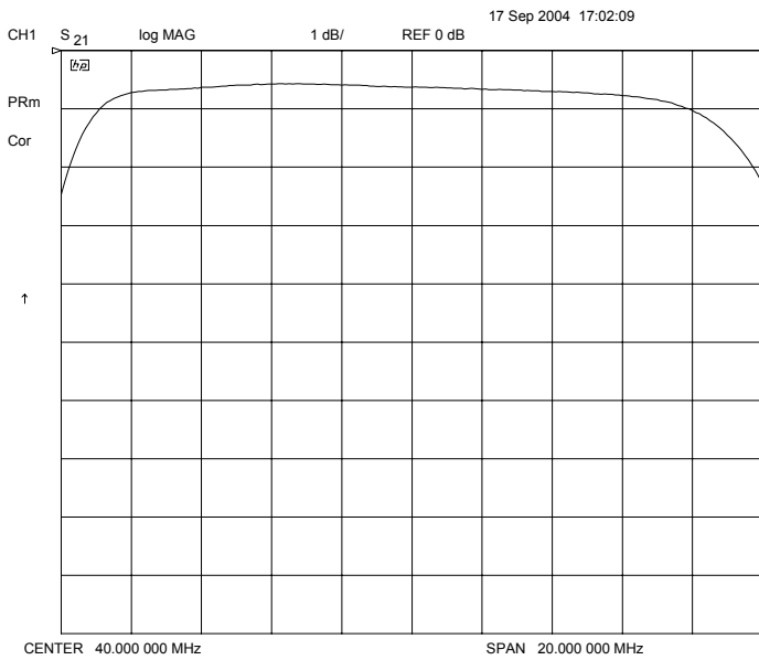
Passband Amplitude (1 dB/div)