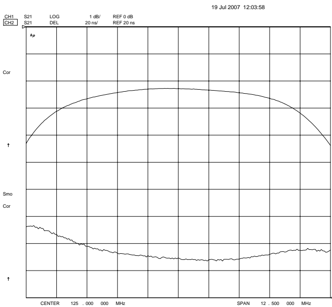
Passband Amplitude & Group Delay (1 dB/div & 20 nsec/div)